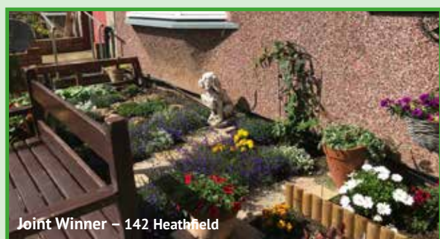
Joint Winner – 142 Heathfield