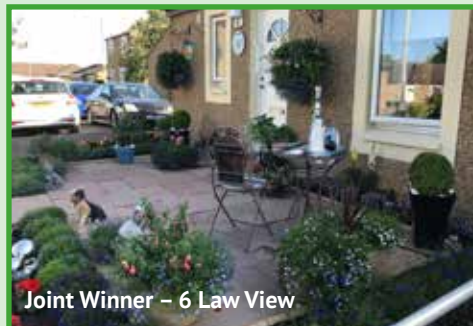
Joint Winner – 6 Law View