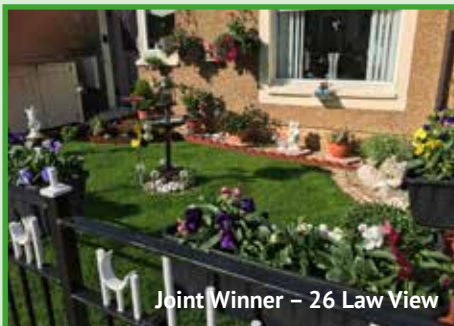
Joint Winner – 26 Law View