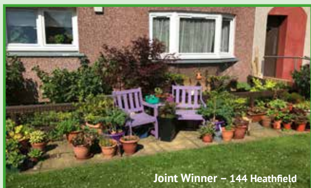
Joint Winner – 144 Heathfield